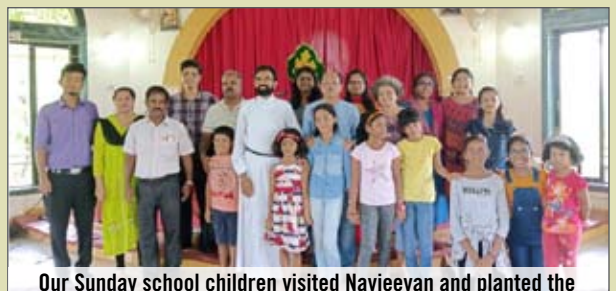
Our Sunday school children visited Navjeevan and planted the flower saplings.