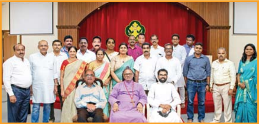
Our Executive Committee Members