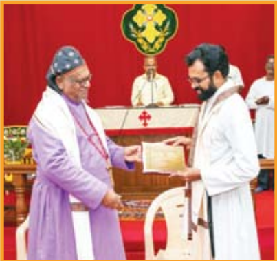
Our Thirumeni Honouring our Achen on the 21st anniversary as an ordained priest of Mar Thoma Church