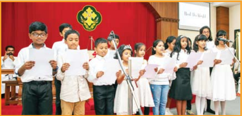
Our Junior Choir