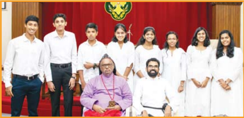
Our First Holy Communicants'