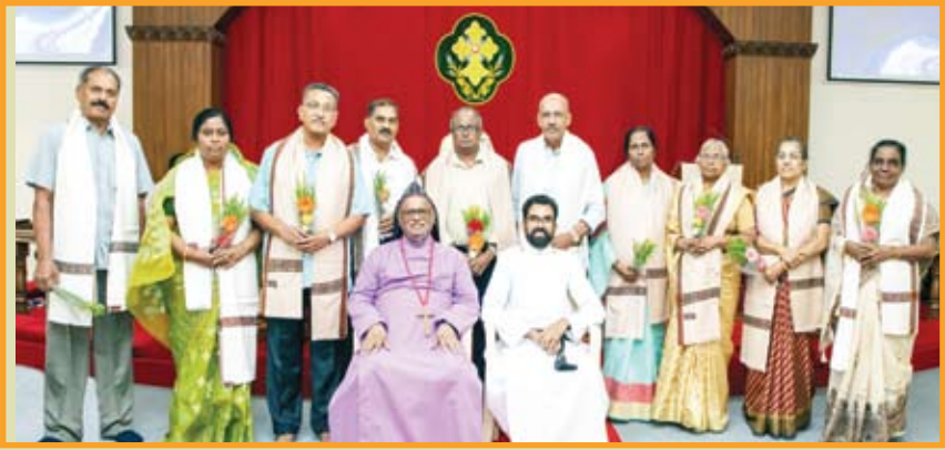
Our White Pearls