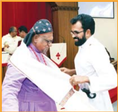
Our Achen Honouring our Thirumeni on the 30th year of consecration as a Bishop of Mar Thoma Church