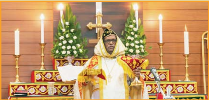
Holy Communion by Thirumeni