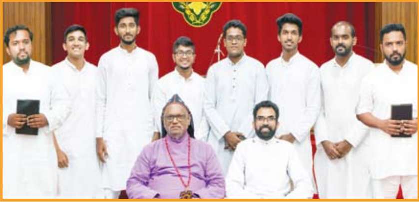
Our Altar Boys