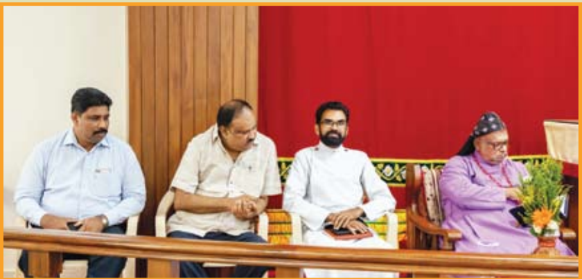
Parish Day 2019