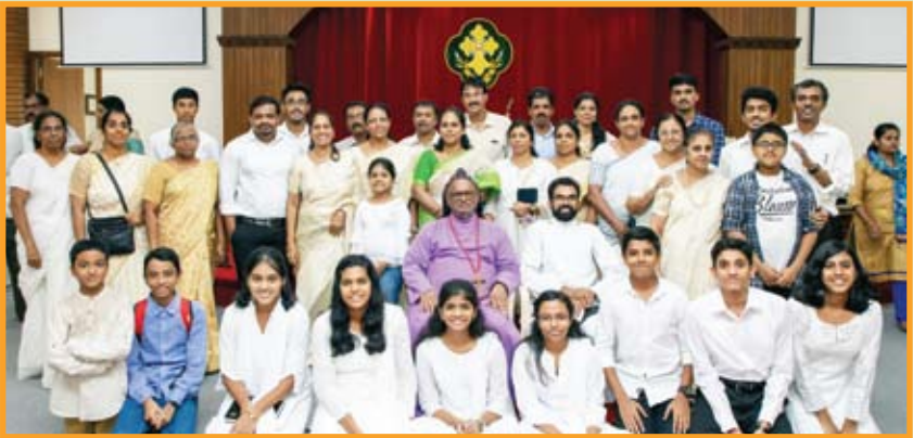
Our First Communicants with parents and God parents